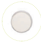
Journey Colorless Blender (JM-0095)

In addition to these color rich combinations, we offer three add-on options: