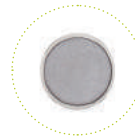
Journey Brush Silver (JM-0097)

A special tools add-on is also available: