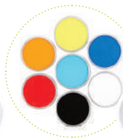
Limeade Splash (JM-O113)