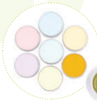
Lemon Grass (JM-O110)

The Fun Stampers Journey PanPastels are individually packaged in four color family combinations. Each color combination comes ready to use with its own Sofft Tools. We have also added an additional single PanPastel to each color palette.