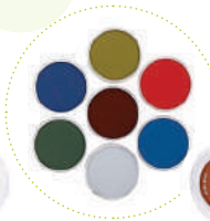
Hazelnut Blend (JM-O112)