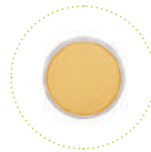
Journey Brush Gold (JM-0096)