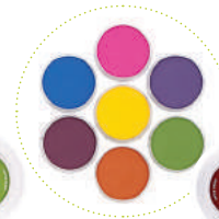
Raspberry Berry (JM-O111)